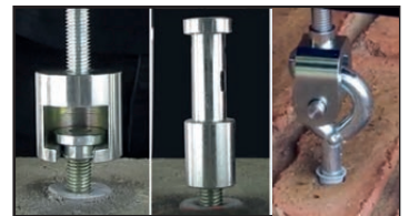
Wide range of adaptors.

Turning handle design incorporating operating nut and detachable handles allowing use in confined spaces.