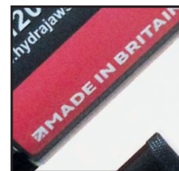
Made in Britain.

Telescopic legs for quick and easy height adjustment.