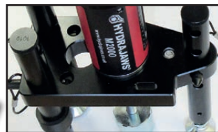
Improved load spreading bridge design.