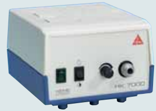
HK 7000 F.O. Projector