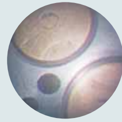
HEINE SFM 8 Endoscope with 7400 Single fibres