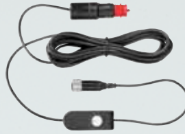
Connecting Cord for Cigarette Lighter Socket