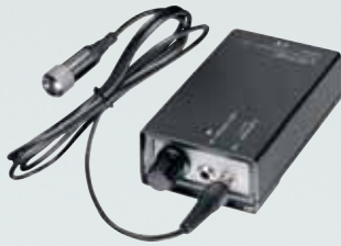
Accubox I with Connecting Cord